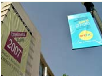
A "battle of the banners" outside the D.C. convention center