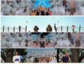
Stills from Cliff Evans' epic video installation, Road to Mount Weather , staged by DC's Curator's Office

Assuming the economy holds up, the weather is good, and advance hype hits the right audiences, artDC returns in May 2008, when it could start to evolve a distinct identity as one fair among many of varying sizes, orientations and degrees of hipness now dotting the globe.