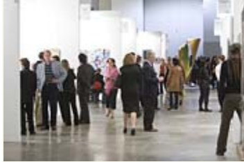
ArtDC gets ready for business in Washington, D.C.